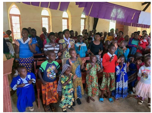
Big Welcome for team